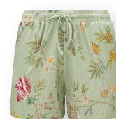
BOB Short Trousers

La Dolce Vita Light Green 95% Viscose | 5% Elastane