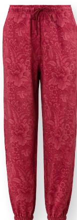
BRITT Long Trousers

Casa dei Fiori Raspberry 48% Cotton | 48% Modal | 4% Elastane