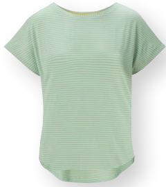
TATUM Short Sleeve Top Little Sumo Stripe Green 48% Viscose | 48% Polyester | 4% Elastane