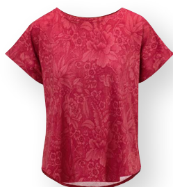
TATUM Sport Top

Casa dei Fiori Raspberry 95% Cotton | 5% Elastane