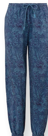
BRITT Long Trousers

Casa dei Fiori Blue 48% Cotton | 48% Modal | 4% Elastane