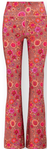
BONNY Long Sport Trousers Señorita Pip Dark Pink 36% Cotton | 36% Modal | 28% Elastane