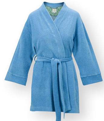
NADIA Kimono Petite Sumo Stripe Blue 80% Cotton | 20% Polyester