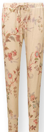
BOBIEN Long Trousers Amor de Dios Sand 95% Viscose | 5% Elastane