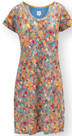
DJOY Short Sleeve Nightdress Tutti i Fiori Light Blue 95% Viscose | 5% Elastane