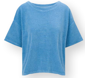
TIFFANY Short Sleeve Top Petite Sumo Stripe Blue 80% Cotton | 20% Polyester