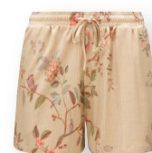
BOB Short Trousers Amor de Dios Sand 95% Viscose | 5% Elastane