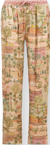
BELIN Long Trousers Alcazar Multicolour 100% Viscose