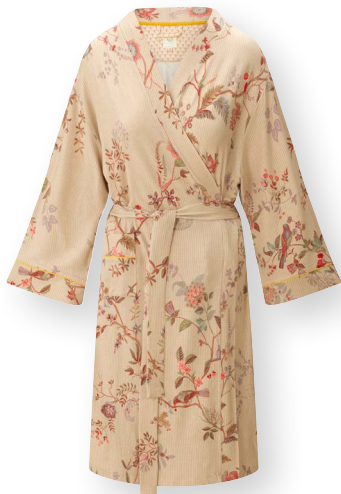
NAOMI Kimono Amor de Dios Sand 95% Viscose | 5% Elastane