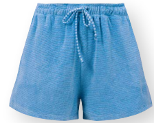
BISOU Short Trousers Petite Sumo Stripe Blue 80% Cotton | 20% Polyester