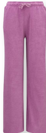
BRITTNEY Long Trousers Petite Sumo Stripe Lilac 80% Cotton | 20% Polyester