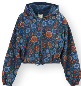
HANNY Jacket Señorita Pip Dark Blue 95% Cotton | 5% Elastane