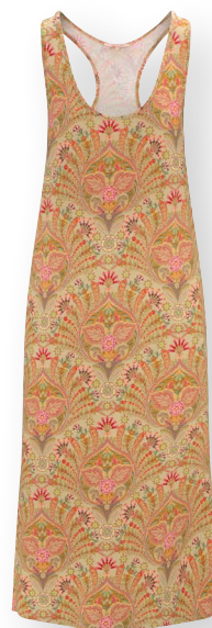
DAMARA Sleeveless Nightdress Alba Khaki 95% Viscose | 5% Elastane