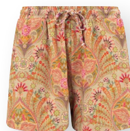
BOB Short Trousers Alba Khaki 95% Viscose | 5% Elastane