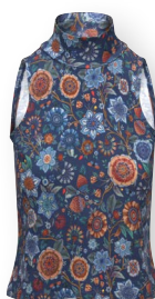
TULA Sport Top Señorita Pip Dark Blue 48% Cotton | 48% Modal | 4% Elastane