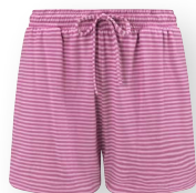
BOB Short Trousers Little Sumo Stripe Lilac 48% Viscose | 48% Polyester | 4% Elastane