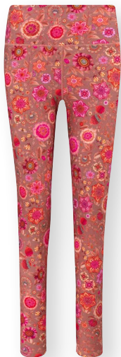
BELLA Long Sport Trousers Señorita Pip Dark Pink 36% Cotton | 36% Modal | 28% Elastane