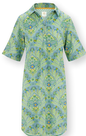
DEWI Short Sleeve Nightdress Alba Blue Green 95% Viscose | 5% Elastane