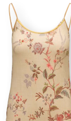
SELINA Sleeveless Top Amor de Dios Sand 95% Viscose | 5% Elastane