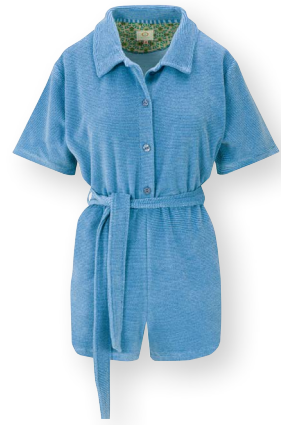
PATTY Jumpsuit Petite Sumo Stripe Blue 80% Cotton | 20% Polyester