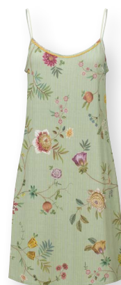
DIEZEL Sleeveless Nightdress

La Dolce Vita Light Green 95% Viscose | 5% Elastane