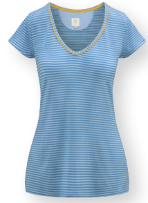
TOY Short Sleeve Top Little Sumo Stripe Blue 48% Viscose | 48% Polyester | 4% Elastane