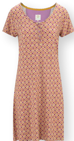
DAISY Short Sleeve Nightdress Verano Lilac 95% Viscose | 5% Elastane