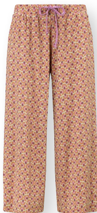
CELESTE Culotte Trousers Verano Lilac 100% Cotton