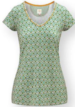
TOY Short Sleeve Top Verano Green 95% Viscose | 5% Elastane