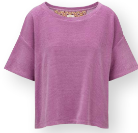
TIFFANY Short Sleeve Top Petite Sumo Stripe Lilac 80% Cotton | 20% Polyester