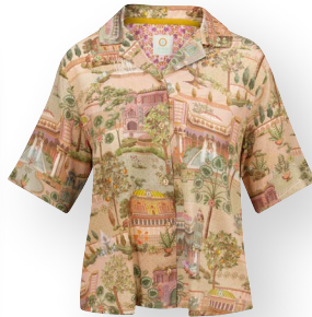
FLORA Short Sleeve Top Alcazar Multicolour 100% Viscose