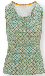
TONI Sleeveless Top Verano Green 100% Cotton