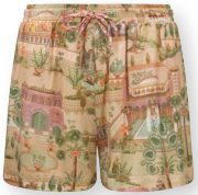
BOB Short Trousers Alcazar Multicolour 100% Viscose