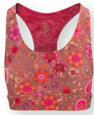
TAHNEE Sport Top Señorita Pip Dark Pink 36% Cotton | 36% Modal | 28% Elastane