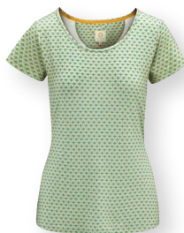
TILLY Short Sleeve Top Mi Vida Green 95% Viscose | 5% Elastane