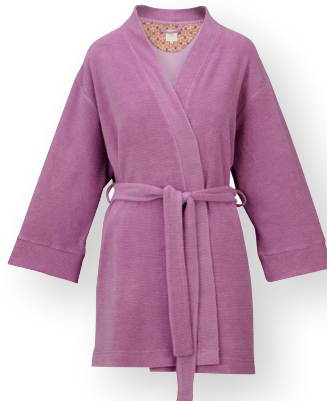
NADIA Kimono Petite Sumo Stripe Lilac 80% Cotton | 20% Polyester