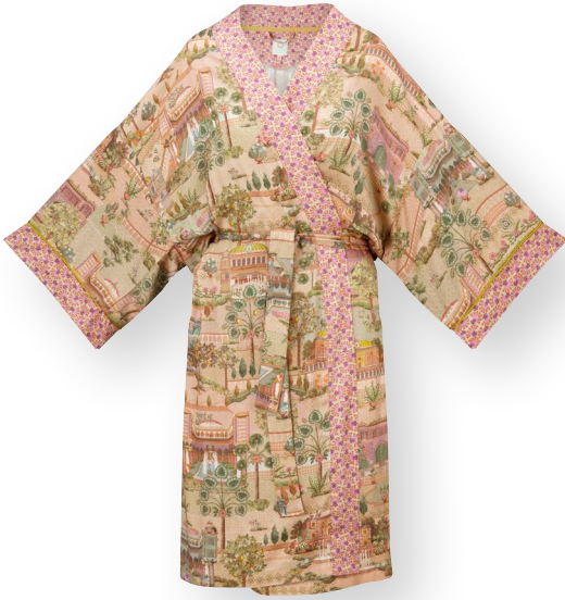
NOELLE Kimono Alcazar Multicolour 100% Viscose