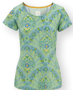
TILLY Short Sleeve Top Alba Blue Green 95% Viscose | 5% Elastane