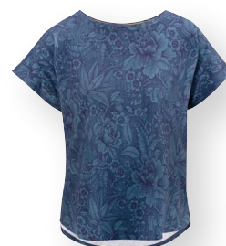
TATUM Sport Top

Casa dei Fiori Blue 95% Cotton | 5% Elastane