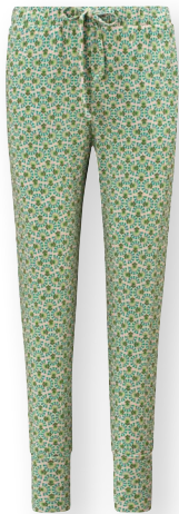
BOBIEN Long Trousers Verano Green 95% Viscose | 5% Elastane