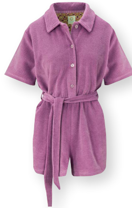
PATTY Jumpsuit Petite Sumo Stripe Lilac 80% Cotton | 20% Polyester