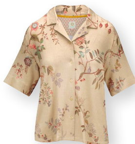
FLORA Short Sleeve Top Amor de Dios Sand 95% Viscose | 5% Elastane