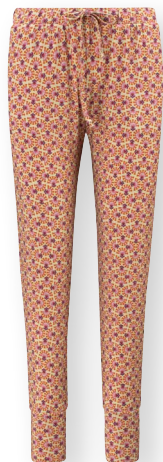
BOBIEN Long Trousers Verano Lilac 95% Viscose | 5% Elastane