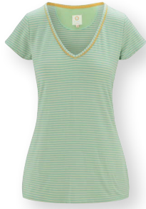
TOY Short Sleeve Top Little Sumo Stripe Green 48% Viscose | 48% Polyester | 4% Elastane