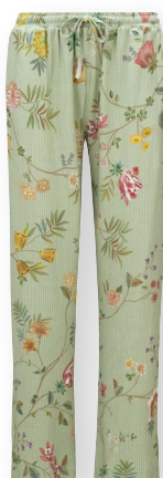
BELIN Long Trousers

La Dolce Vita Light Green 95% Viscose | 5% Elastane