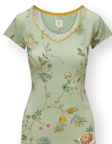
TOY Short Sleeve Top

La Dolce Vita Light Green 95% Viscose | 5% Elastane