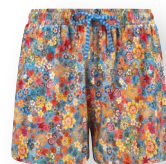
BOB Short Trousers Tutti i Fiori Light Blue 95% Viscose | 5% Elastane