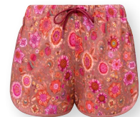
BALI Short Trousers Señorita Pip Dark Pink 95% Cotton | 5% Elastane