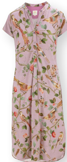
DALIA Short Sleeve Nightdress Good Nightingale Lilac 95% Viscose | 5% Elastane

Good Nightingale Lilac 95% Viscose | 5% Elastane