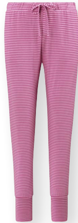
BOBIEN Long Trousers Little Sumo Stripe Lilac 48% Viscose | 48% Polyester | 4% Elastane