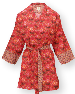
NELLY Kimono Fiesta de Flamencos Red 100% Cotton