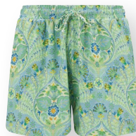
BOB Short Trousers Alba Blue Green 95% Viscose | 5% Elastane