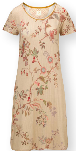
DANIELA Short Sleeve Nightdress Amor de Dios Sand 95% Viscose | 5% Elastane