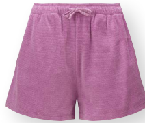
BISOU Short Trousers Petite Sumo Stripe Lilac 80% Cotton | 20% Polyester