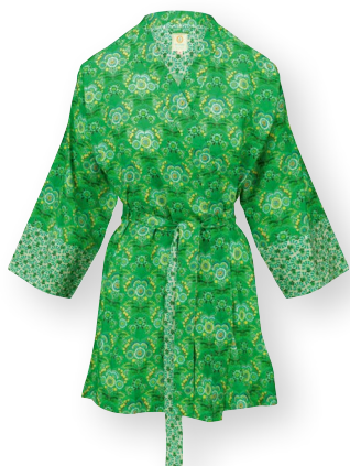
NELLY Kimono Fiesta de Flamencos Green 100% Cotton