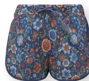
BALI Short Trousers Señorita Pip Dark Blue 95% Cotton | 5% Elastane