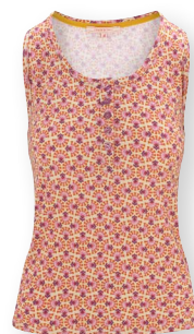
TONI Sleeveless Top Verano Lilac 100% Cotton