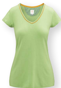
TOY Short Sleeve Top Solid Green 95% Viscose | 5% Elastane