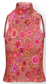
TULA Sport Top Señorita Pip Dark Pink 48% Cotton | 48% Modal | 4% Elastane