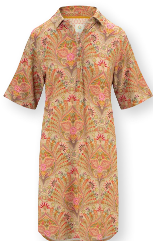
DEWI Short Sleeve Nightdress Alba Khaki 95% Viscose | 5% Elastane