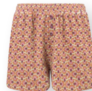
BOBI Short Trousers Verano Lilac 100% Cotton