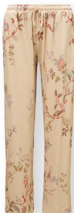
BELIN Long Trousers Amor de Dios Sand 95% Viscose | 5% Elastane