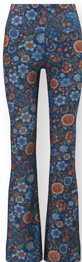
BONNY Long Sport Trousers Señorita Pip Dark Blue 36% Cotton | 36% Modal | 28% Elastane