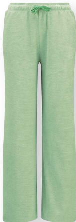
BRITTNEY Long Trousers Petite Sumo Stripe Green 80% Cotton | 20% Polyester