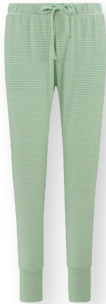
BOBIEN Long Trousers Little Sumo Stripe Green 48% Viscose | 48% Polyester | 4% Elastane