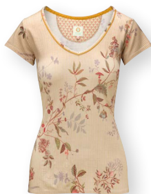
TOY Short Sleeve Top Amor de Dios Sand 95% Viscose | 5% Elastane