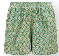
BOBI Short Trousers Verano Green 100% Cotton