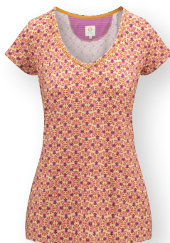
TOY Short Sleeve Top Verano Lilac 95% Viscose | 5% Elastane