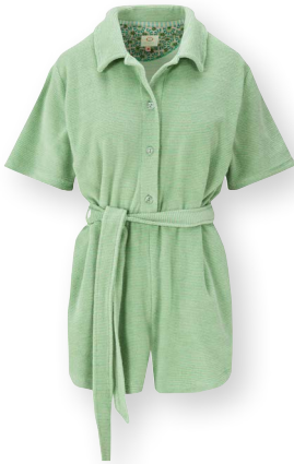
PATTY Jumpsuit Petite Sumo Stripe Green 80% Cotton | 20% Polyester