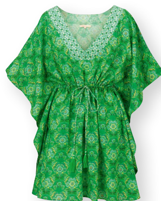
DANINI Tunic Fiesta de Flamencos Green 100% Cotton