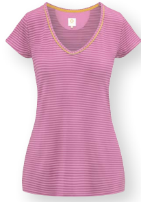
TOY Short Sleeve Top Little Sumo Stripe Lilac 48% Viscose | 48% Polyester | 4% Elastane