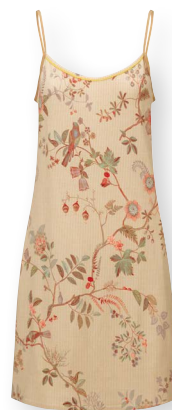
DIEZEL Sleeveless Nightdress Amor de Dios Sand 95% Viscose | 5% Elastane