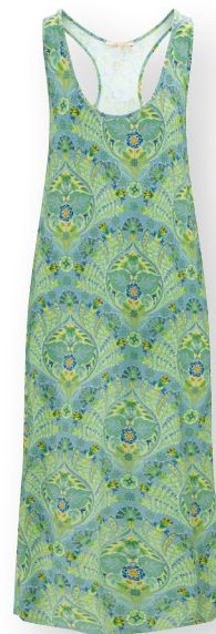
DAMARA Sleeveless Nightdress Alba Blue Green 95% Viscose | 5% Elastane