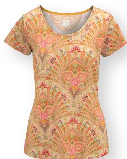
TILLY Short Sleeve Top Alba Khaki 95% Viscose | 5% Elastane