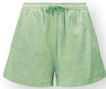
BISOU Short Trousers Petite Sumo Stripe Green 80% Cotton | 20% Polyester