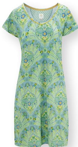
DJOY Short Sleeve Nightdress Alba Blue Green 95% Viscose | 5% Elastane