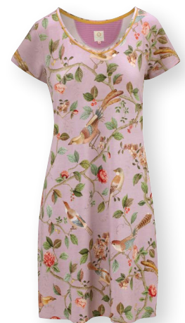
DJOY Short Sleeve Nightdress Good Nightingale Lilac 95% Viscose | 5% Elastane