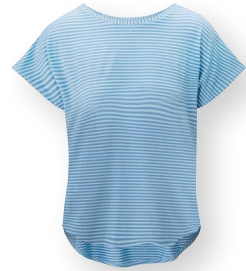
TATUM Short Sleeve Top Little Sumo Stripe Blue 48% Viscose | 48% Polyester | 4% Elastane