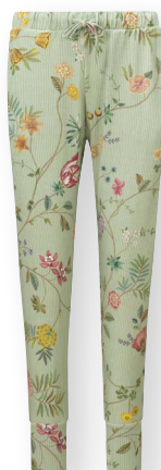
BOBIEN Long Trousers

La Dolce Vita Light Green 95% Viscose | 5% Elastane