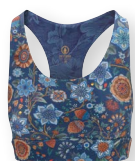
TAHNEE Sport Top Señorita Pip Dark Blue 36% Cotton | 36% Modal | 28% Elastane