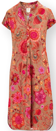
DALIA Short Sleeve Nightdress

Viva las Flores Pink 95% Viscose | 5% Elastane