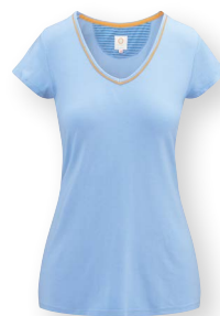
TOY Short Sleeve Top Solid Blue 95% Viscose | 5% Elastane