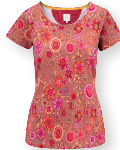
TILLY Short Sleeve Top Señorita Pip Dark Pink 48% Cotton | 48% Modal | 4% Elastane