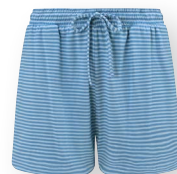
BOB Short Trousers Little Sumo Stripe Blue 48% Viscose | 48% Polyester | 4% Elastane