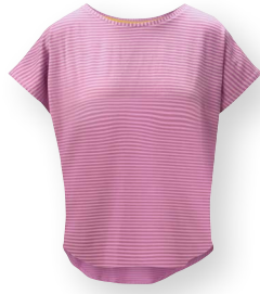
TATUM Short Sleeve Top Little Sumo Stripe Lilac 48% Viscose | 48% Polyester | 4% Elastane