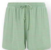
BOB Short Trousers Little Sumo Stripe Green 48% Viscose | 48% Polyester | 4% Elastane