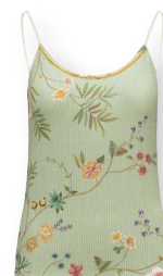
SELINA Sleeveless Top

La Dolce Vita Light Green 95% Viscose | 5% Elastane