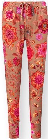
BOBIEN Long Trousers

Viva las Flores Pink 95% Viscose | 5% Elastane