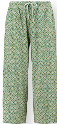
CELESTE Culotte Trousers Verano Green 100% Cotton