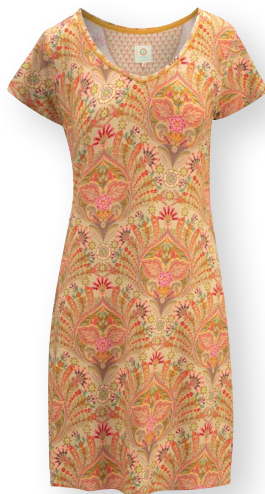
DJOY Short Sleeve Nightdress Alba Khaki 95% Viscose | 5% Elastane