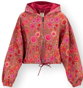
HANNY Jacket Señorita Pip Dark Pink 95% Cotton | 5% Elastane