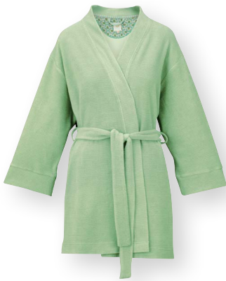
NADIA Kimono Petite Sumo Stripe Green 80% Cotton | 20% Polyester