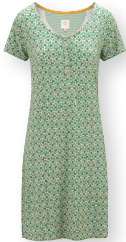
DAISY Short Sleeve Nightdress Verano Green 95% Viscose | 5% Elastane