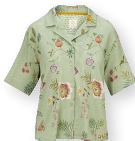
FLORA Short Sleeve Top

La Dolce Vita Light Green 95% Viscose | 5% Elastane