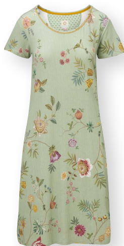
DANIELA Short Sleeve Nightdress

La Dolce Vita Light Green 95% Viscose | 5% Elastane