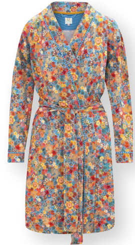
NINNY Kimono Tutti i Fiori Light Blue 95% Viscose | 5% Elastane