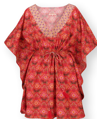
DANINI Tunic Fiesta de Flamencos Red 100% Cotton