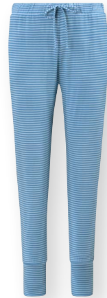
BOBIEN Long Trousers Little Sumo Stripe Blue 48% Viscose | 48% Polyester | 4% Elastane