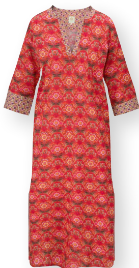
DAVINA Tunic Fiesta de Flamencos Red 100% Cotton