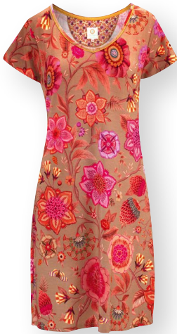
DJOY Short Sleeve Nightdress

Viva las Flores Pink 95% Viscose | 5% Elastane