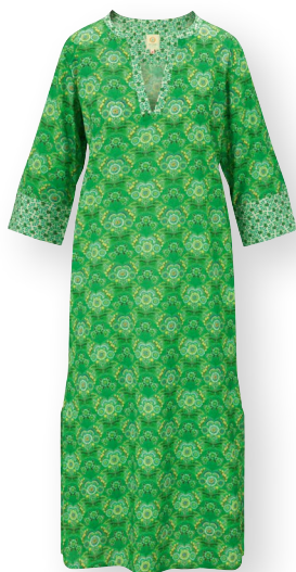
DAVINA Tunic Fiesta de Flamencos Green 100% Cotton