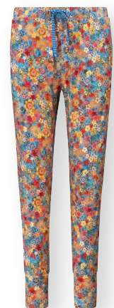
BOBIEN Long Trousers Tutti i Fiori Light Blue 95% Viscose | 5% Elastane