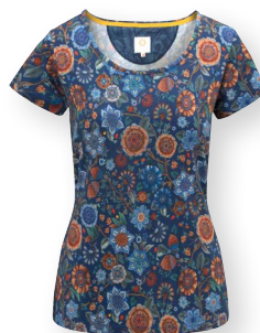
TILLY Short Sleeve Top Señorita Pip Dark Blue 48% Cotton | 48% Modal | 4% Elastane