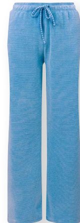
BRITTNEY Long Trousers Petite Sumo Stripe Blue 80% Cotton | 20% Polyester