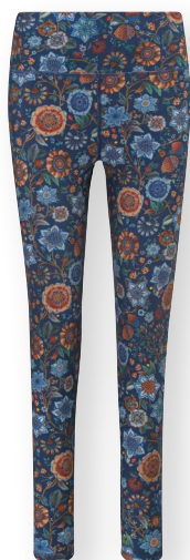
BELLA Long Sport Trousers Señorita Pip Dark Blue 36% Cotton | 36% Modal | 28% Elastane