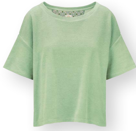
TIFFANY Short Sleeve Top Petite Sumo Stripe Green 80% Cotton | 20% Polyester