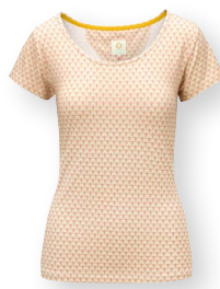
TILLY Short Sleeve Top Mi Vida Pink 95% Viscose | 5% Elastane