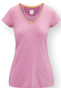
TOY Short Sleeve Top Solid Lilac 95% Viscose | 5% Elastane